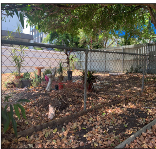
At 1 metre - too short.

Unsuitable fencing material - barbed wire, dog wire, star pickets.