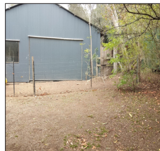
Star picklets and wire.