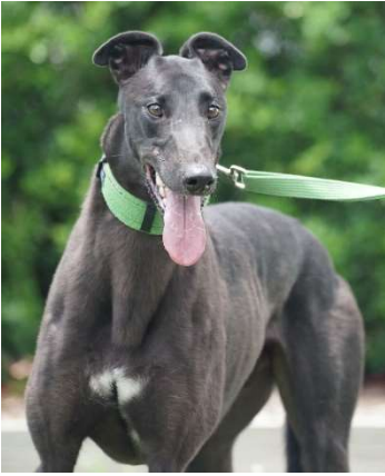
View Bandit's profile